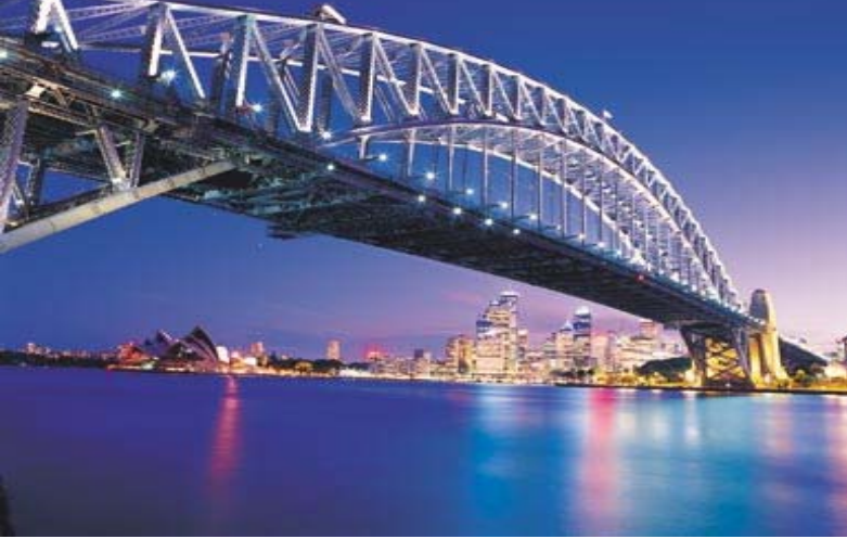
Sydney Harbour Bridge