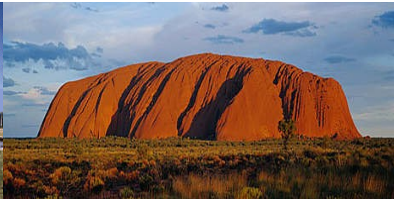
Uluru, Northern Territory